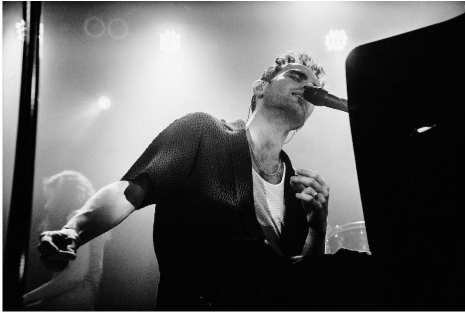
Jordan Rakei to perform for Perth Festival 2025

Perth Festival's already explosive music program just got hotter with Grammy-nominated powerhouse Jordan Rakei and Montreal DJs Maara + RAMZi added to the East Perth Power Station line up.