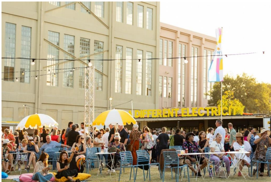
East Perth Power Station

Across the first weekend at the East Perth Power Station , expect a powerful all First Nations opening night line-up, starting tonight with the Main Stage headlined by the multi-award-winning electronic duo Electric Fields , who captured everyone's hearts with their 2024 Eurovision performance.