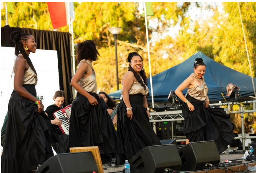
Salama

With many Festival shows close to selling out, tickets are still available for Peter Garrett & The Alter Egos , Mahabharata , 12 Last Songs and Big Name No Blankets . Discover the full Perth Festival 2025 program at perthfestival.com.au . Thanks to the WA Community who play Lotterywest Games, a Lotterywest grant of $9.5 Million has supported the 2025 Perth Festival.