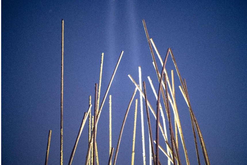
Karla Bidi

Illuminating Perth nights with incredible music, theatre and art all month long